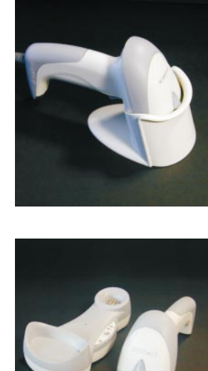
Clockwise from left: Gryphon Stand, Desk holder, Wall holder